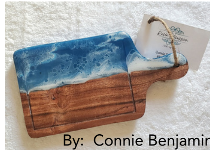
By: Connie Benjamin