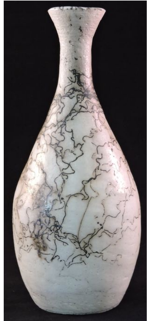
By Wilma Kroese