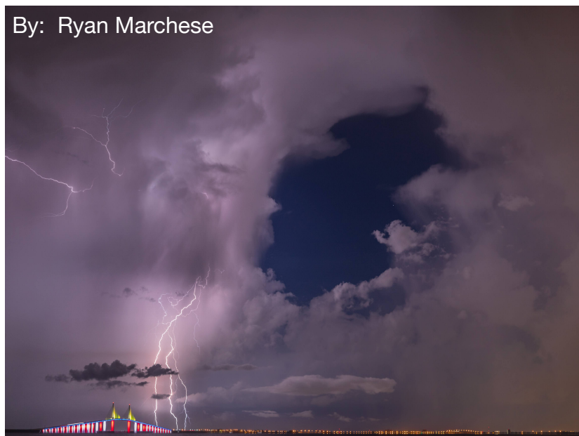
By: Ryan Marchese

Support the ARTS with an Art license plate. The dollars earned from the license plate program is how the Bradenton Area Arts & Culture can support the local art groups - https://myfloridaspecialtyplate.com/state-of-the-arts.html