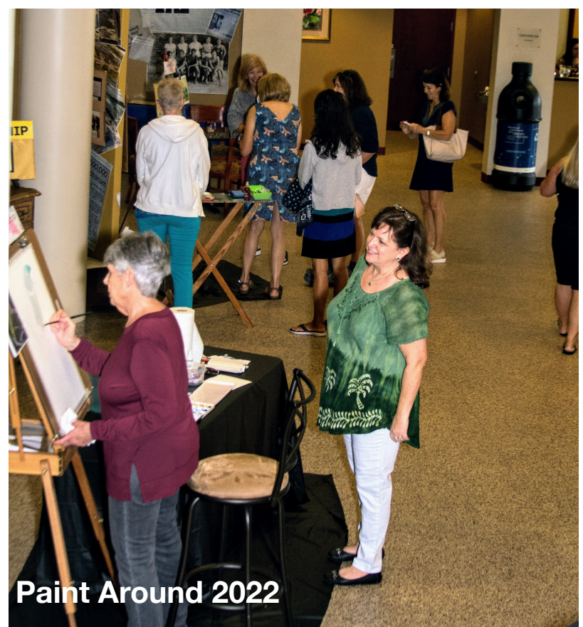
Paint Around 2022

At the end of the session, the 5 uniquely created artworks will be raffled off and most proceeds donated to the art teacher at Tara Elementary school. Our Paint Arouns are our way of giving back to the community and supporting the ARTS!