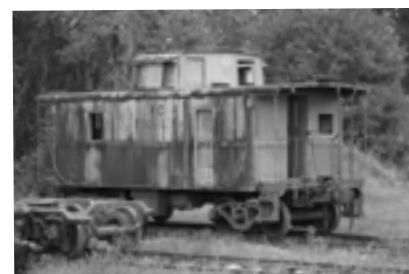
Train by Steven White