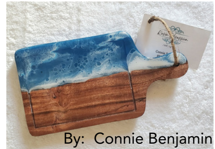
By: Connie Benjamin