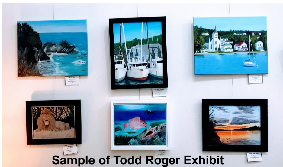
Sample of Todd Roger Exhibit