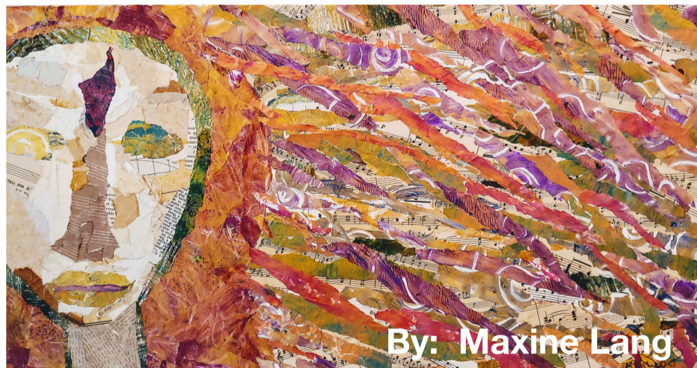
By: Maxine Lang

Members and guests of the Parrish Arts Council learned about the steps, tips, materials, and techniques of mixed media collage last month. Here is a peek. Tip #1 - Gather your materials which can include canvas board, wood, or any surface that can withstand lots of materials applied to it. You'll also need an adhesive such as Mod Podge and lots of different types of paper. Tip #2 - Tear or cut random shapes in different sizes. Apply adhesive to your surface, arrange papers on it by overlapping, and coat with more adhesive. After it dries you're ready to add whatever mediums you choose. For more tips on collage or to add your own tips go to our Facebook Page. If you have any subjects you'd like to get tips on, ask us on Facebook or email us at getinvolved@parrishartscouncil.org .