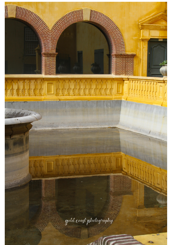
By Steven White