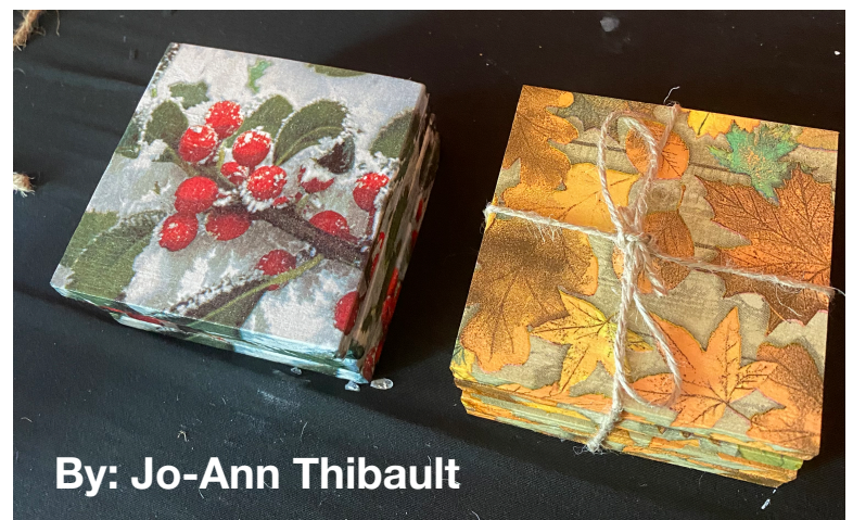
By: Jo-Ann Thibault

Support the ARTS with an Art license plate. The dollars earned from the license plate program is how the Bradenton Area Arts & Culture can support the local art groups - https://myfloridaspecialtyplate.com/state-of-the-arts.html