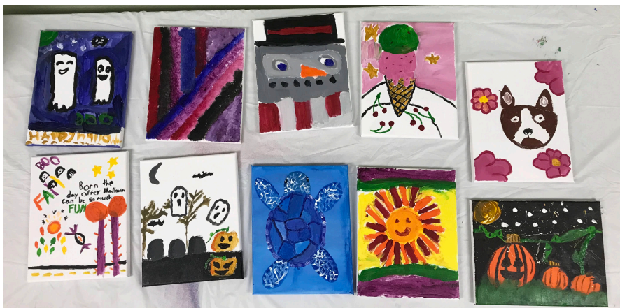
Youth Holiday Exhibit 2023

What a wonderful time we had with the Youth Workshop. The kids had a choice of polymer clay and/or acrylics. We had examples for inspiration to help them decide what to do. For the acrylics they drew what they wanted and then painted it. The clay gave them a workout preparing it, but it was all worth it when they got to roll it out and use cookie cutters to create a shape. They also learned how to create add-ons to decorate the shapes with details.